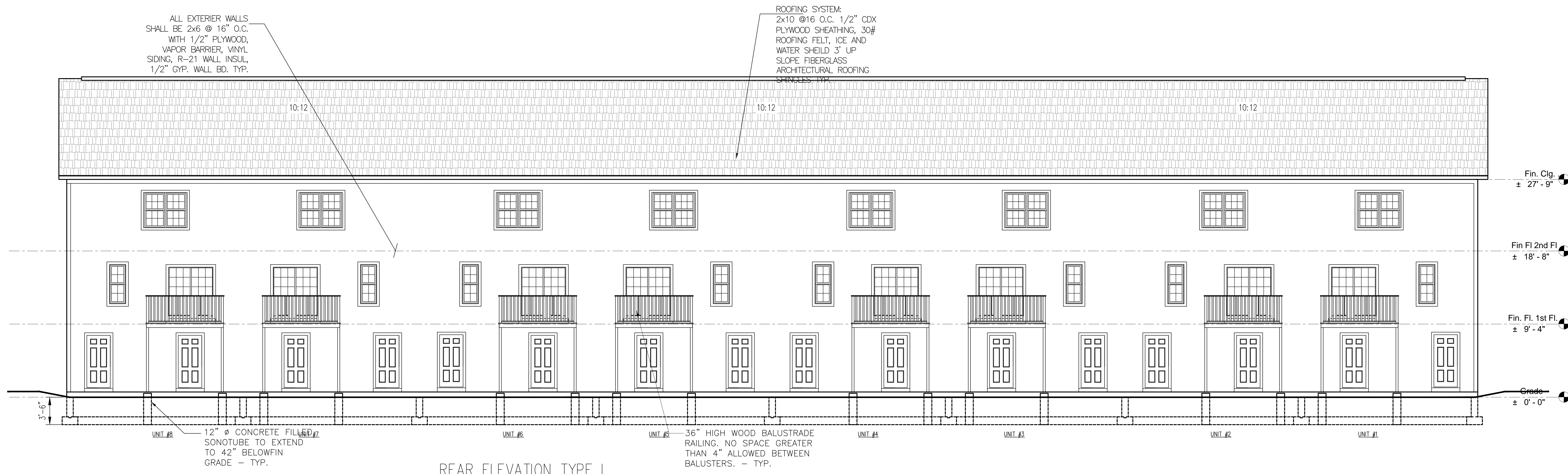
REAR ELEVATION TYPE I 3/16"=1'-0"