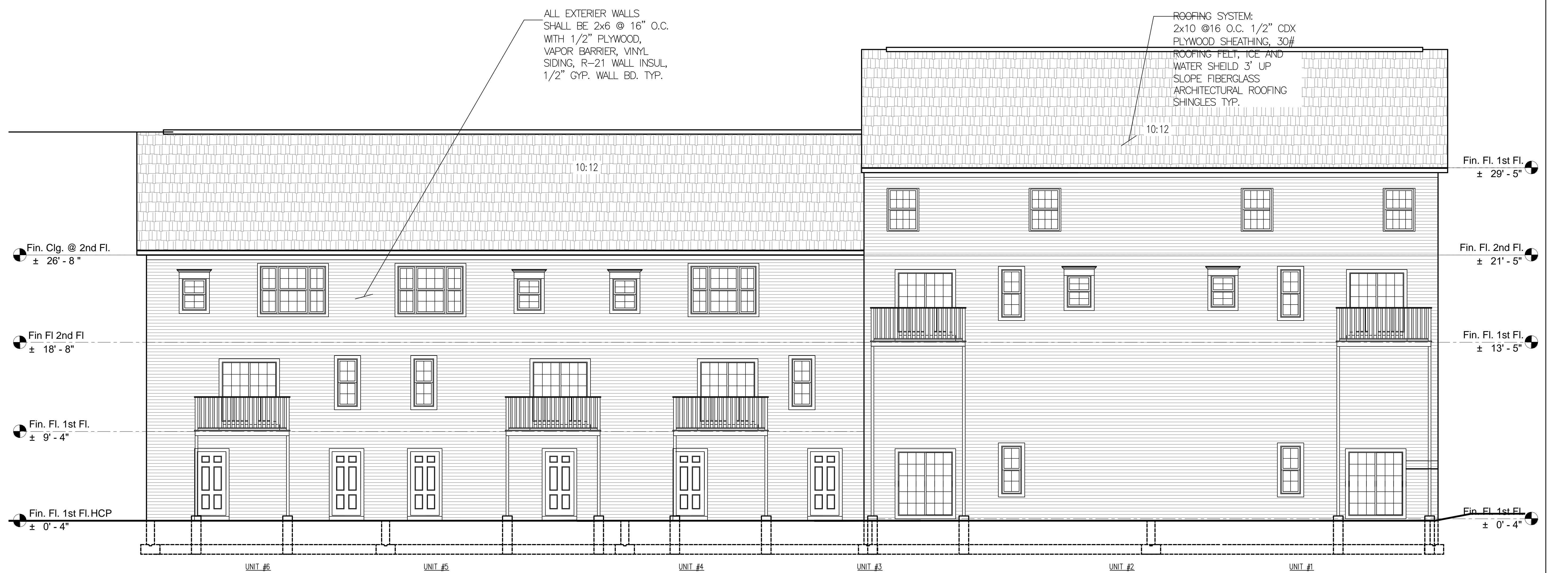
REAR ELEVATION TYPE II 3/16"=1'-0"