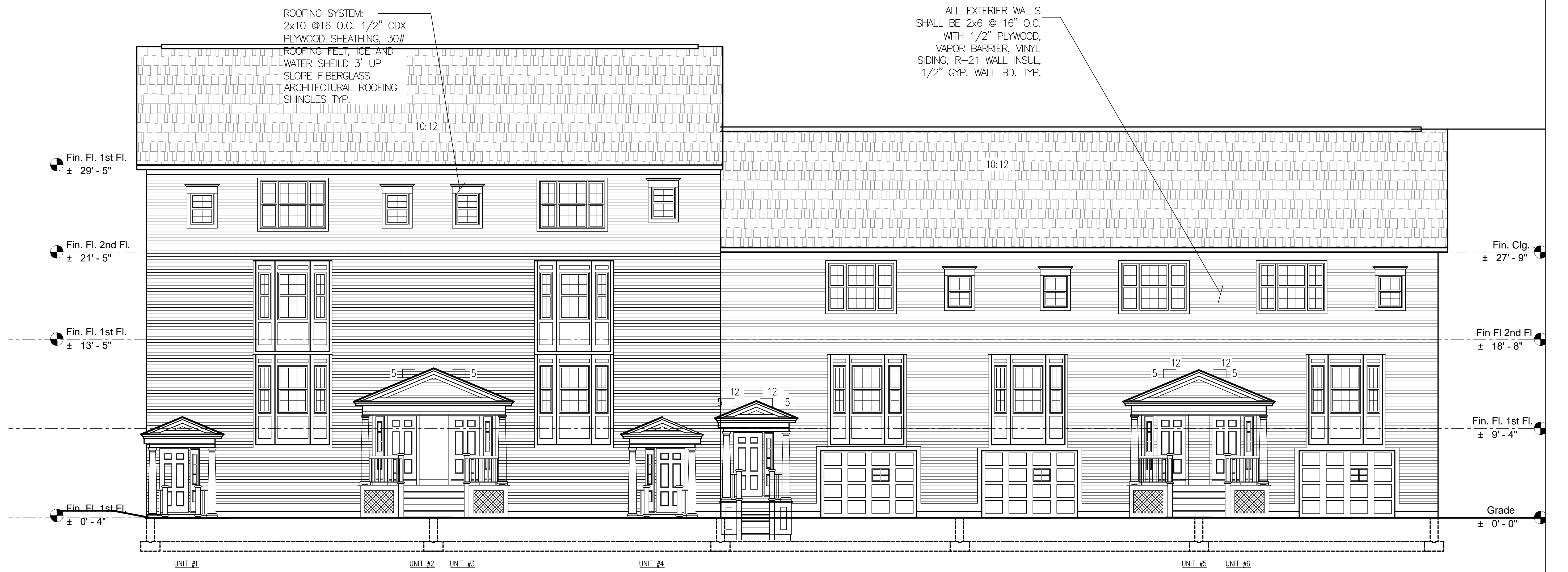
FRONT ELEVATION TYPE I